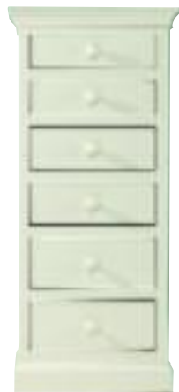
TALL 6 DRAWER CHEST AW/1702W/NNN H145cm W65cm D49cm