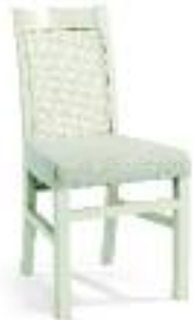
BEDROOM CHAIR AW/1706W/NNN H90cm W44cm D54cm