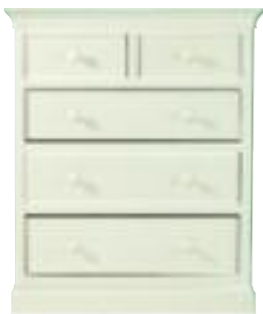
5 DRAWER CHEST AW/1700W/NNN H123cm W104cm D49cm