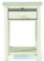
BEDSIDE CHEST AW/1703W/NNN H67cm W46cm D42cm